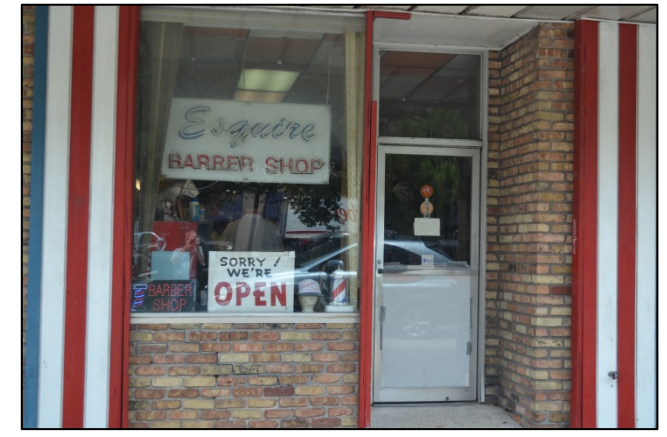
Esquire Barber Shop, 11 E. Garden St. Pensacola, Florida

As of January 2018, there is still an operating barber shop on the same premises, although under different ownership. The address is now 11, rather than 7 E. Garden, and the change is probably due to once larger premises coming before number 7 being subdivided into smaller ones, thereby upping the barber shop's address from number 7 to number 11. Its name is now Esquire Barber Shop whose