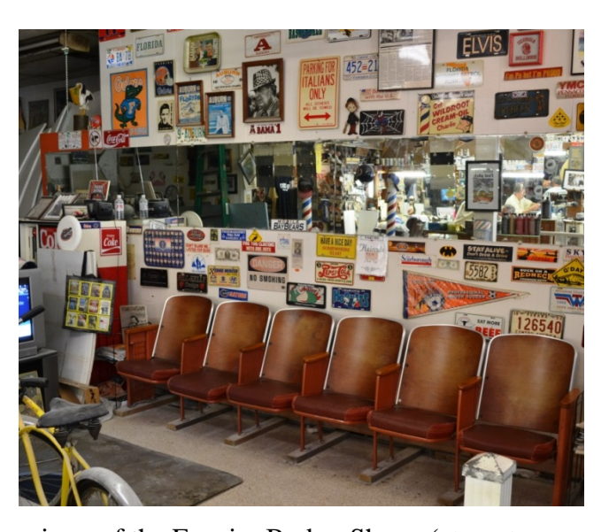
Shown above and on the following page are interior views of the Esquire Barber Shop.